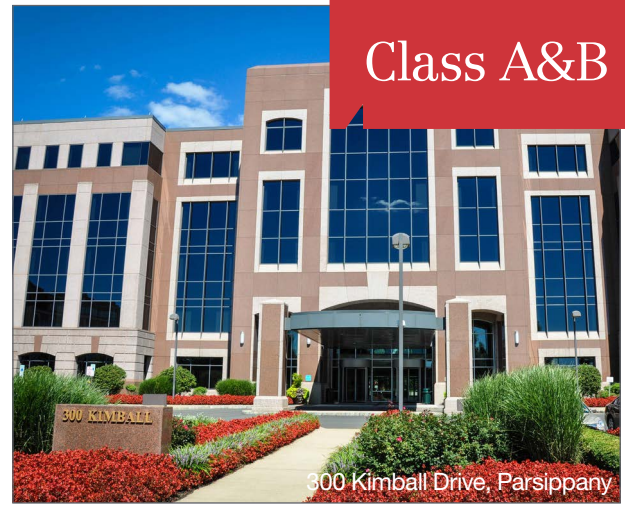
300 Kimball Drive, Parsippany

The Northern and Central New Jersey Class A and B office market consists of 233,962,611 square feet. Average asking rates ended the quarter at $24.62 per square foot. Compared to the first quarter of 2018, the rate is up $0.30 per square foot and compared to the first quarter of 2017, the rate is up $0.79 per square foot.