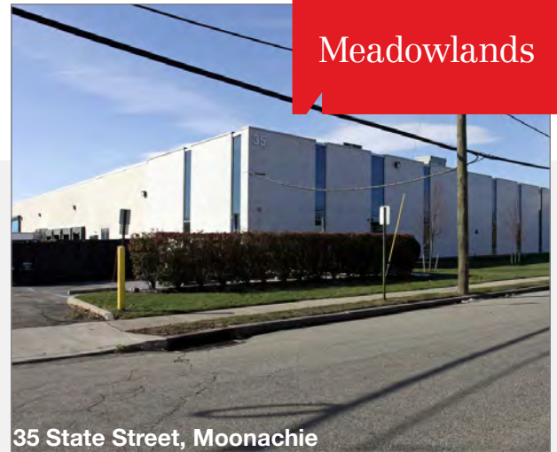
35 State Street, Moonachie

Avanti Linens sold 234 Moonachie Road in Moonachie in a sale leaseback transaction to Liberty Property Trust. The 172,016 square foot industrial manufacturing building sold for $23,500,000 or $136.62 per square foot.