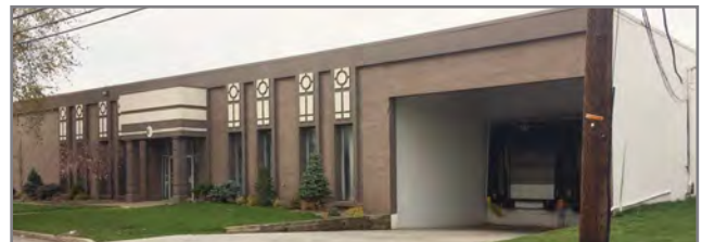
80 Triangle Boulevard, Carlstadt

Available Space: 36,750 sf Office: 5,000 sf Ceiling Height: 16'9" Loading: 2 loading docks 1 drive-in