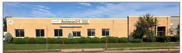
475 Mola Boulevard, Elmwood Park

Available Space: 4,000 sf Office: 4,000 sf