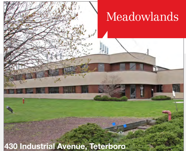
430 Industrial Avenue, Teterboro

Hartz Mountain Industries purchased 700 Belleville Turnpike in Kearny from the Town of Kearny. The 182,195 square foot building was purchased for $5,092,950 or $27.95 per square foot. There are two warehouses that sit on the property. H&M International Transportation is a tenant in the building.