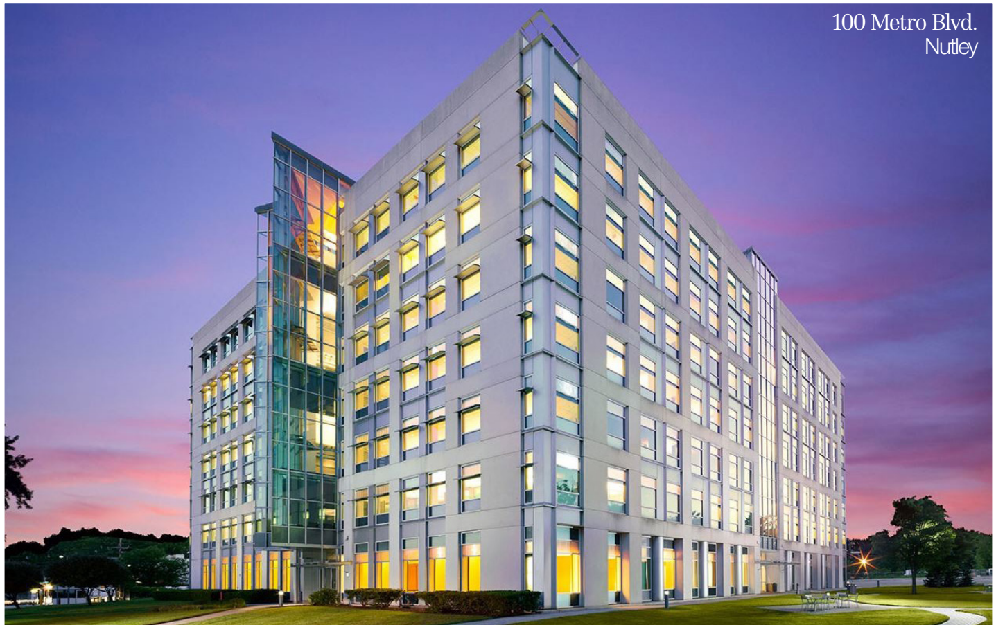
100 Metro Blvd. Nutley