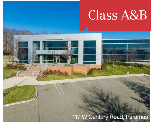
117 W Century Road, Paramus

The Northern and Central New Jersey Class A and B office market consists of 232,457,773 square feet in 12 counties. Average asking rates ended the quarter at $24.68 per square foot, up $0.12 per square foot from the previous quarter. The Hudson County market has the highest rates at $31.47 per square foot. Following behind is the Essex County market which ended the quarter with rates at $26.01 per square foot.