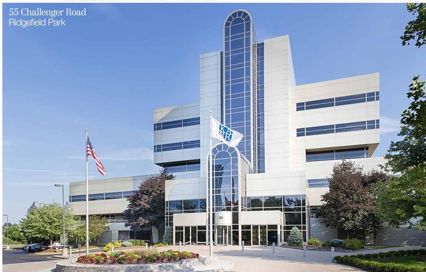
55 Challenger Road Ridgefield Park