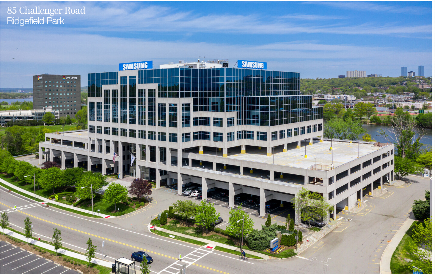
85 Challenger Road Ridgefield Park