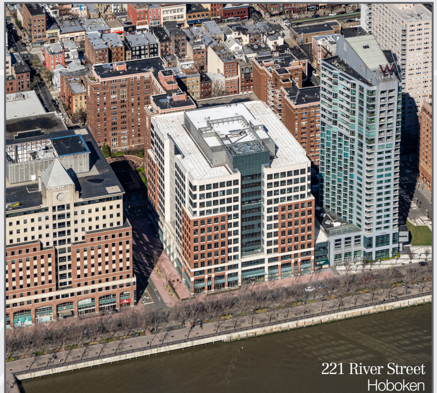
221 River Street Hoboken